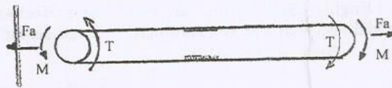
Fig. 11 (a)